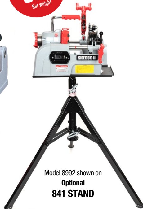
Model 8992 shown on Optional 841 STAND