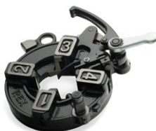
80118* Die Head, Automatic Opening, 1/2" – 2" NPT