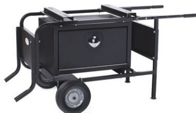
60514 - Cart W/O Toolbox